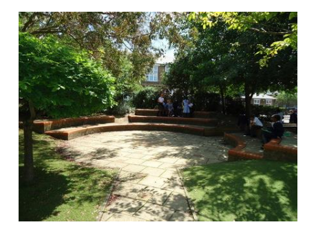
Old Oak Primary School Update Friday, 2<sup>nd</sup> February, 2024