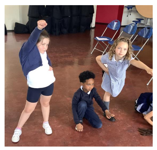
YEAR 5 MATHS WALK*

As part of the maths curriculum, the children in Year 5 spent time on the Scrubs.