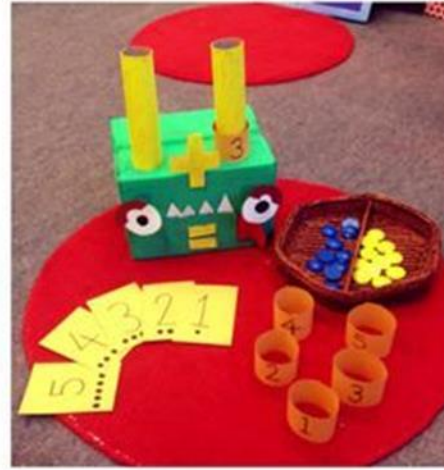
Build an adding machine